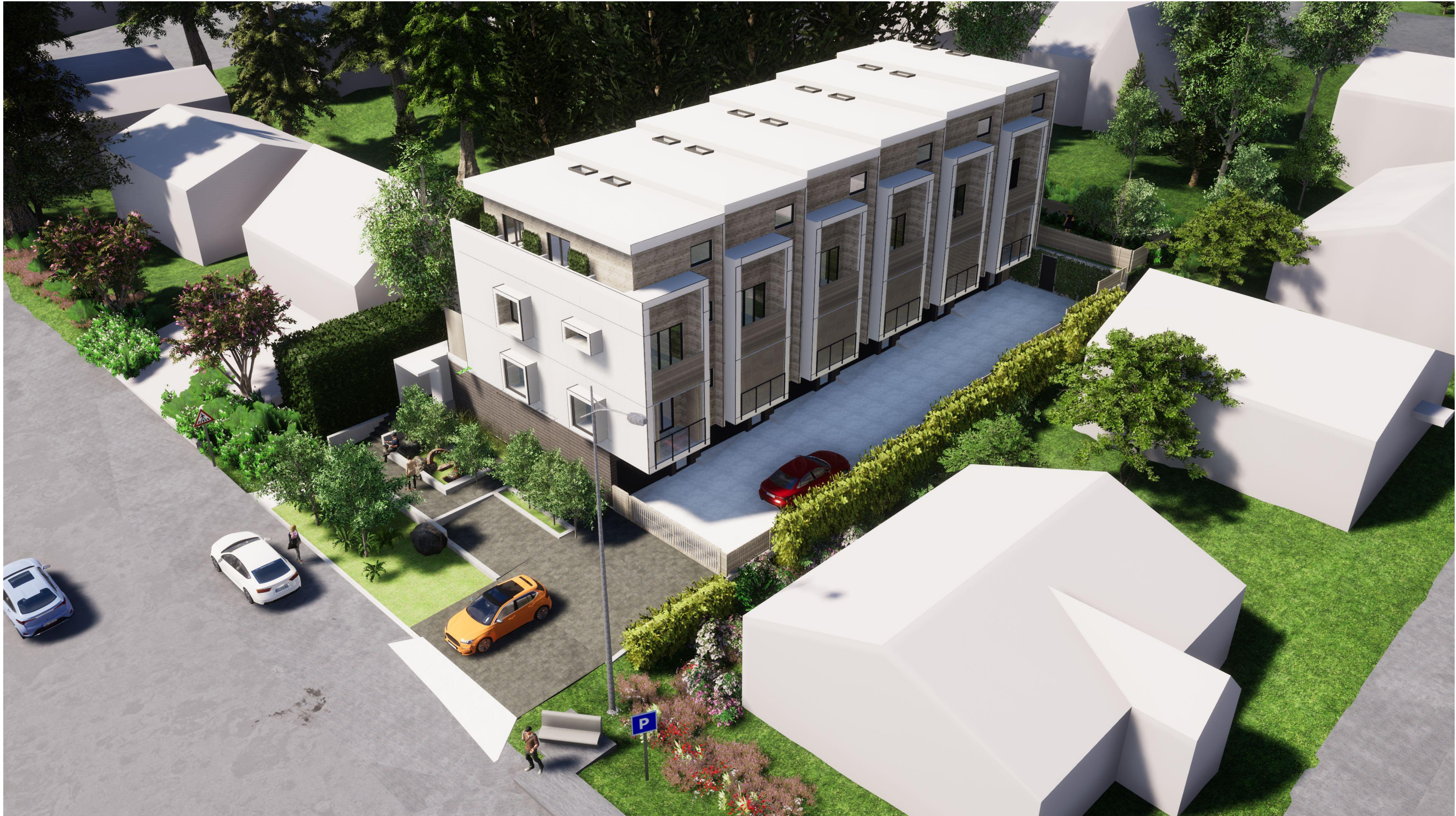
Birds' Eye View from Stewart Ave and Townsite Rd looking South-West