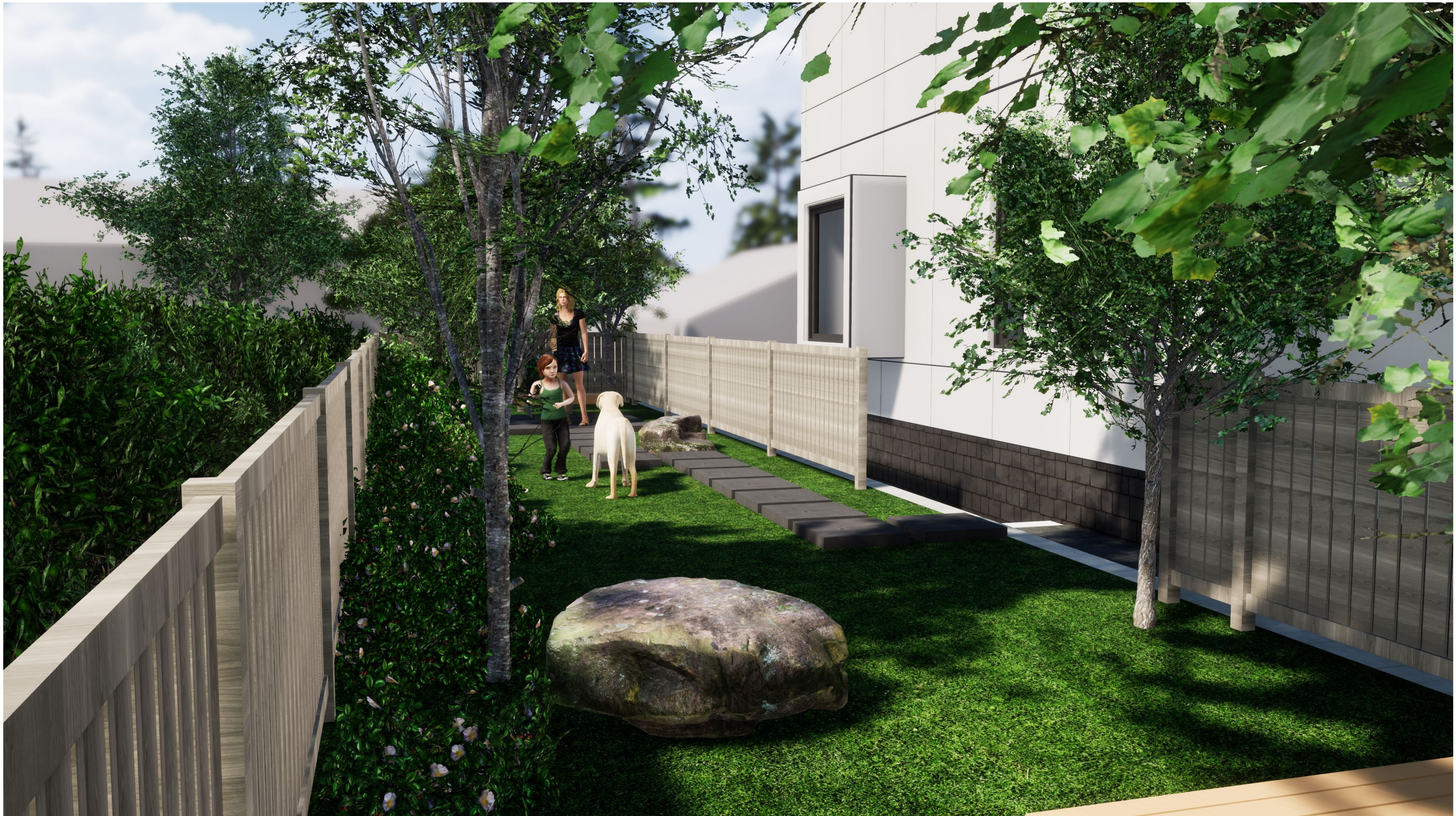
Perspective from South-West corner of site, looking at shared back yard landscaped area.