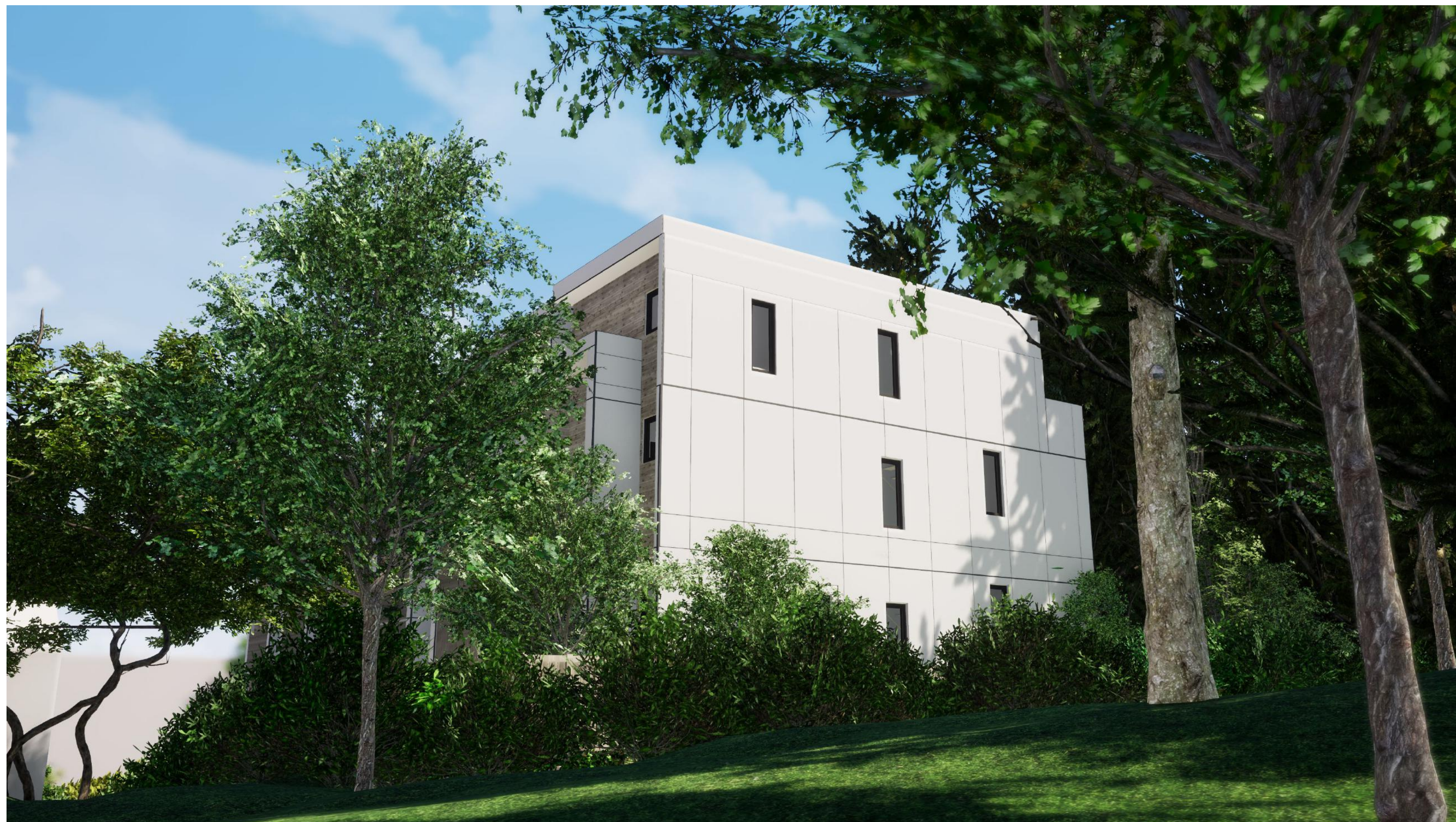
Perspective from North-Western Neighbour's point of view.