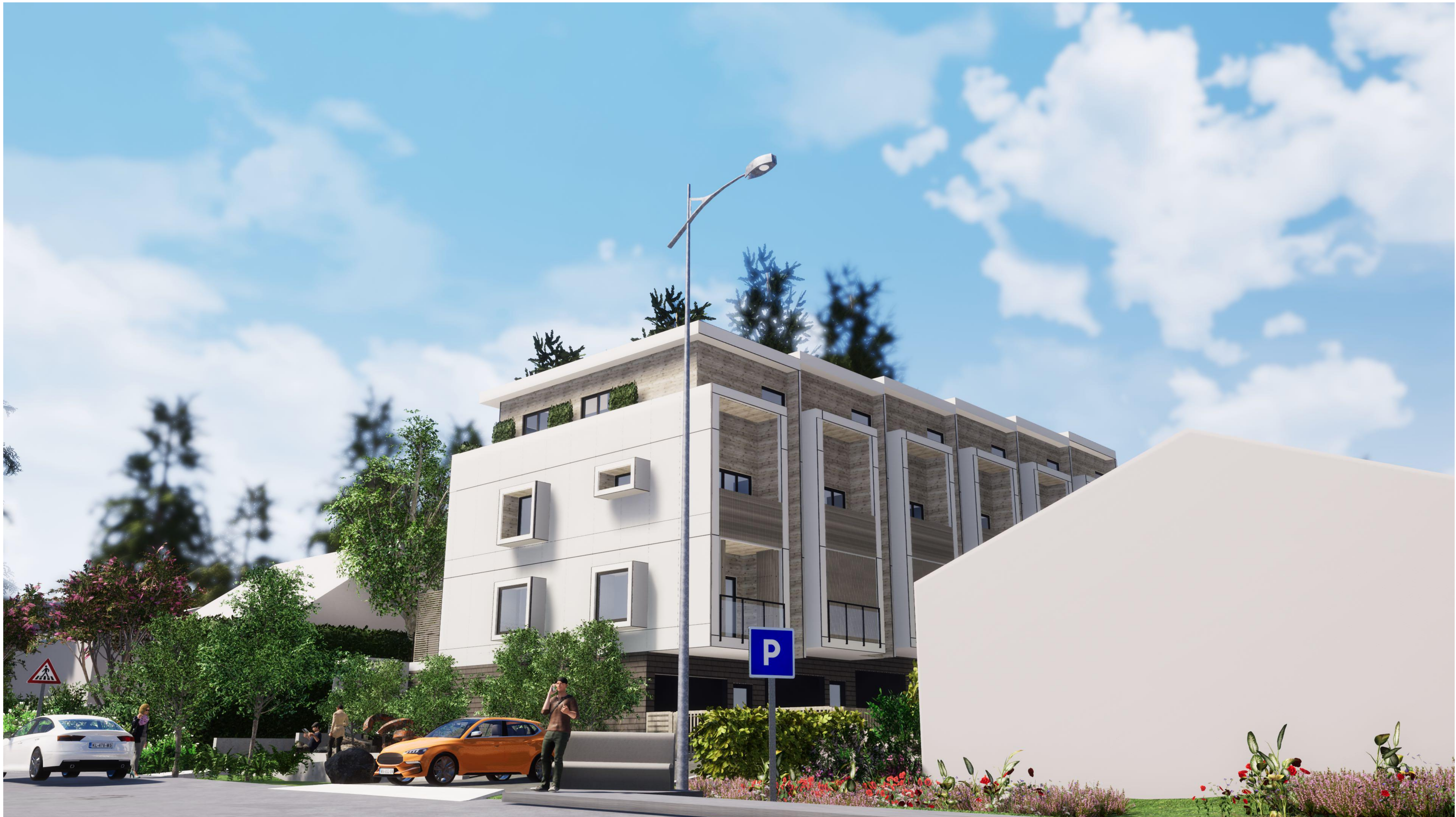
Perspective from corner of Stewart Ave and Townsite Rd looking South-West