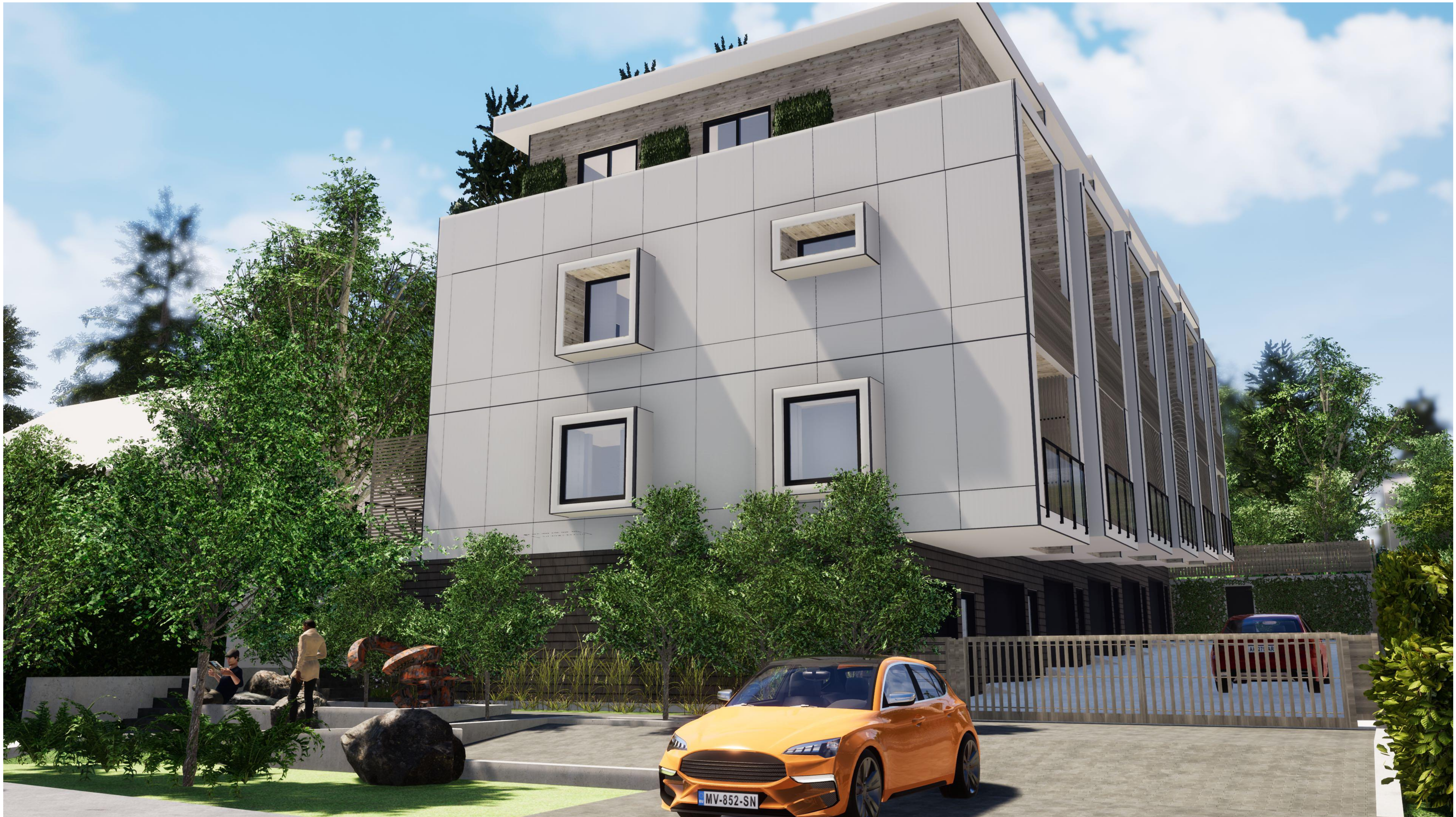
Perspective from Stewart Ave towards vehicular entry, looking South-West