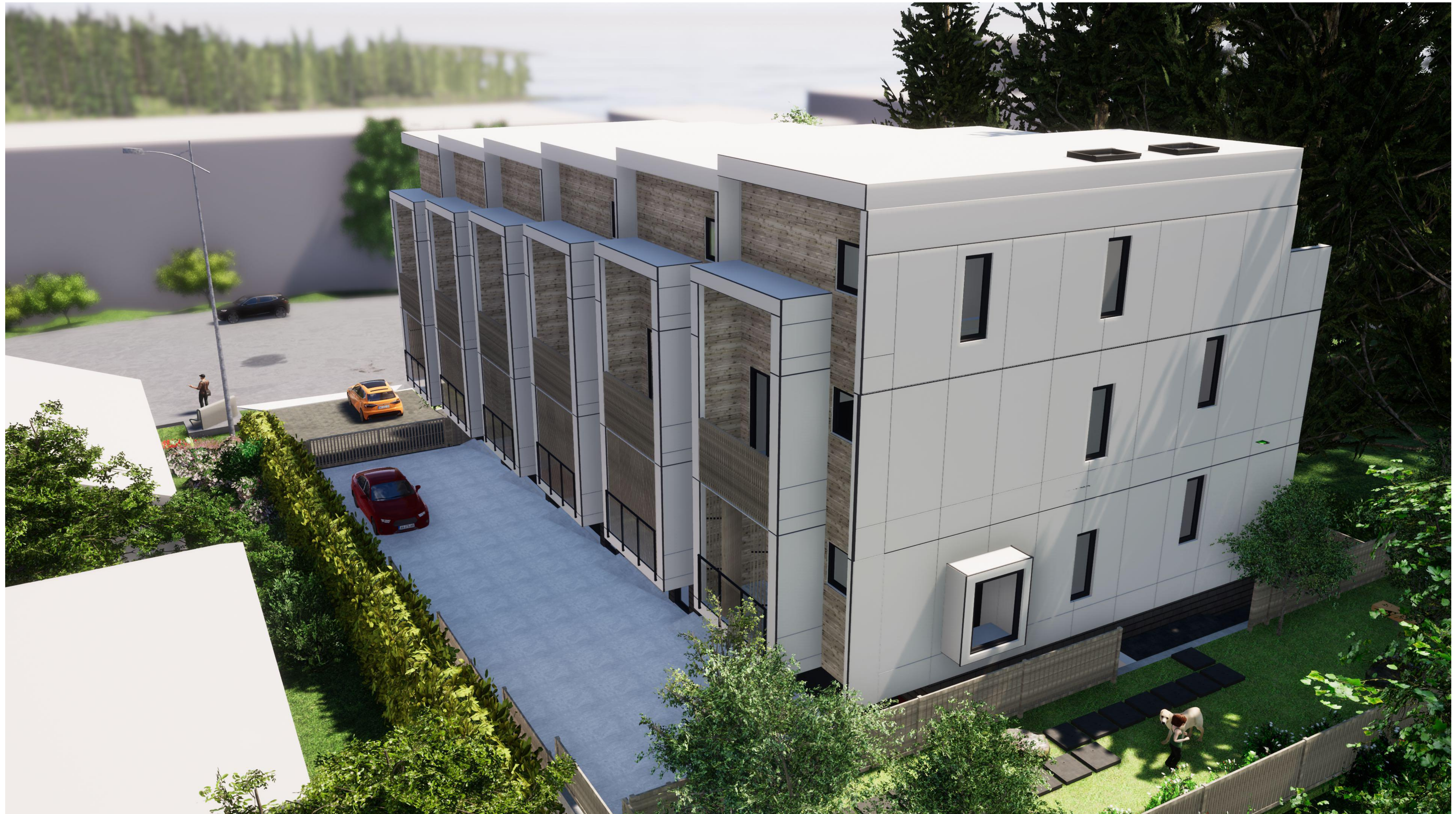
Perspective from North-West corner of site, looking South-East.