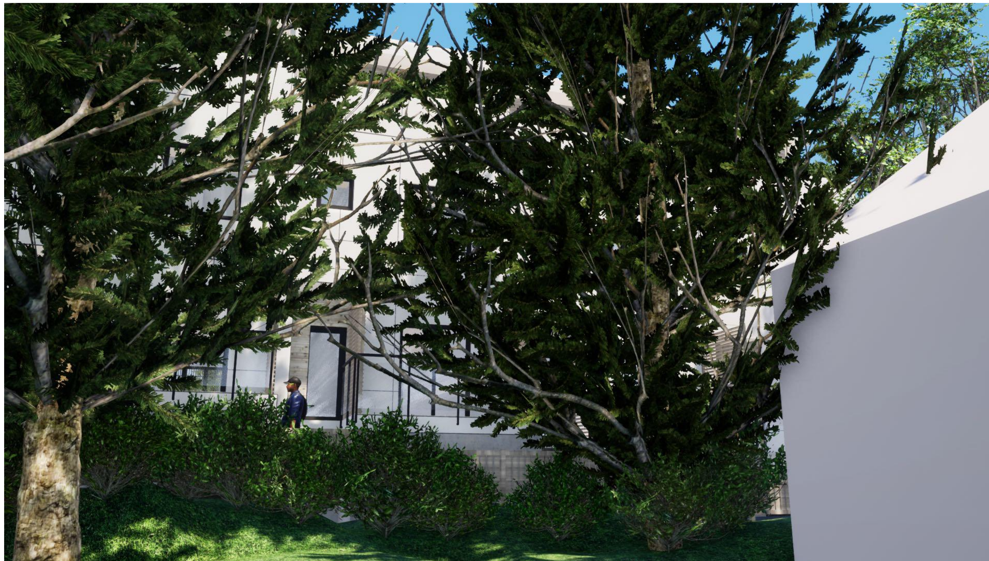
Perspective from Southern Neighbours' point of view, seen from Neighbour Back Yard