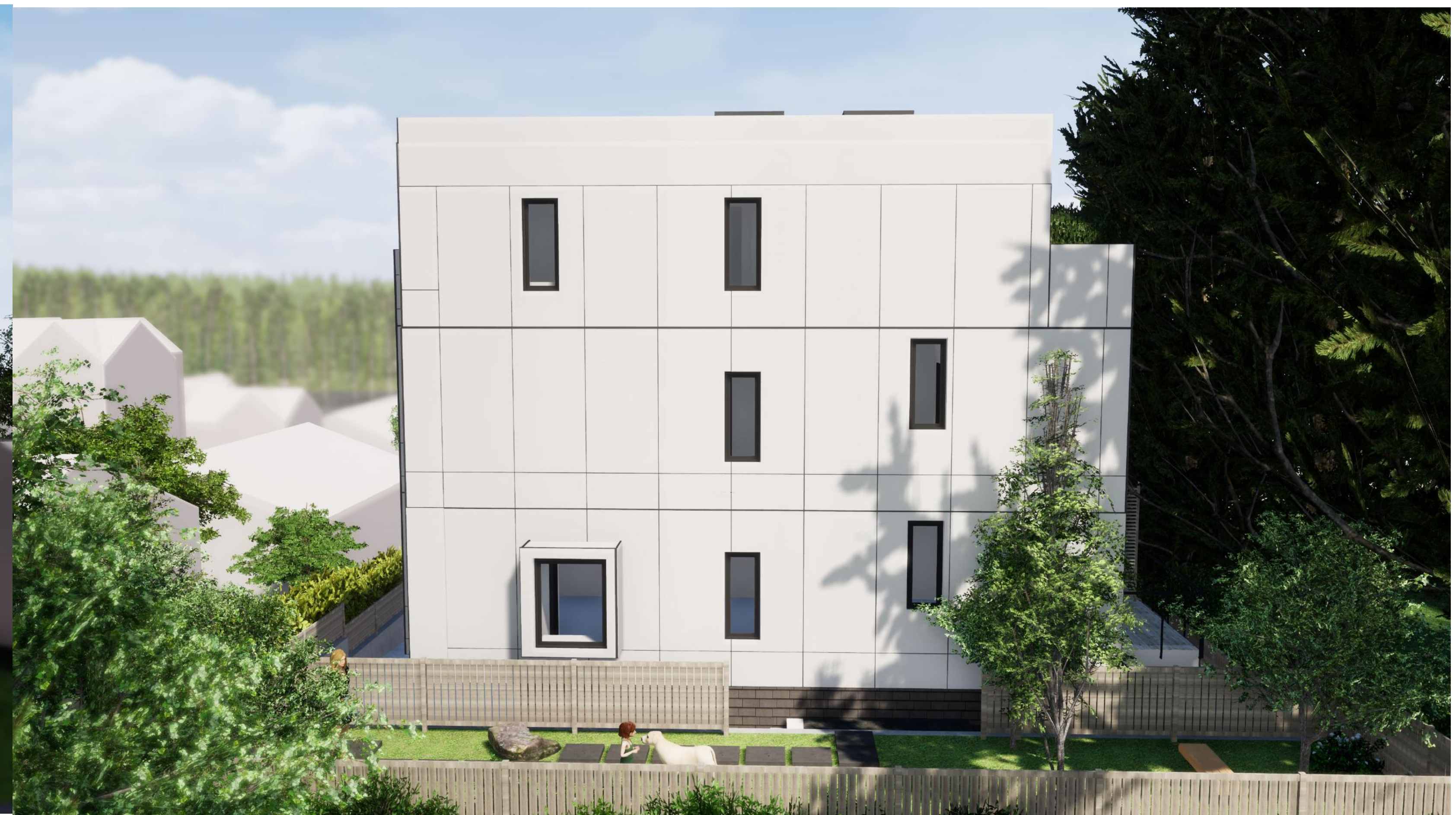
Perspective from Western Neighbour's point of view.