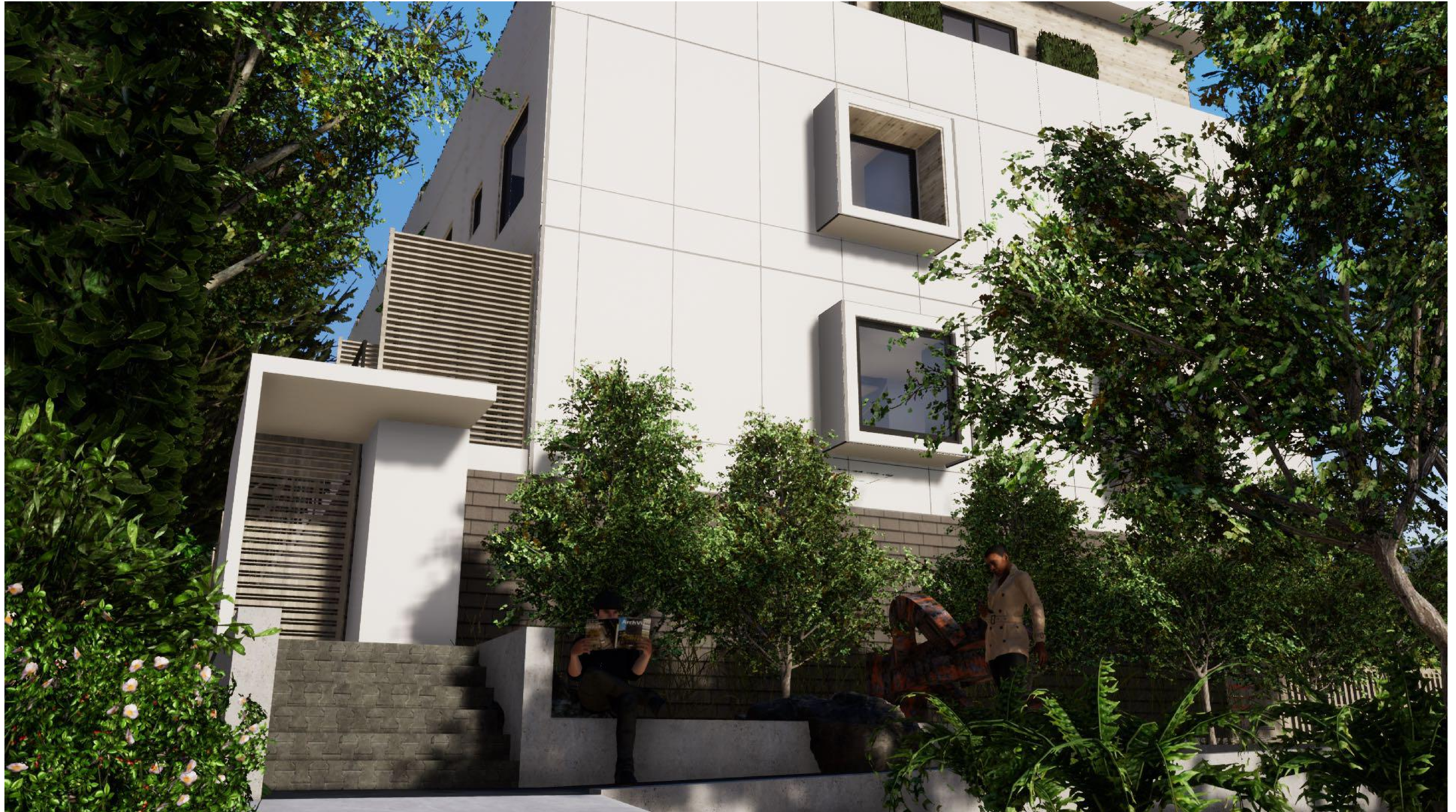
Perspective of landscaped area on front of site and the effect on Streetscape; looking South-East.