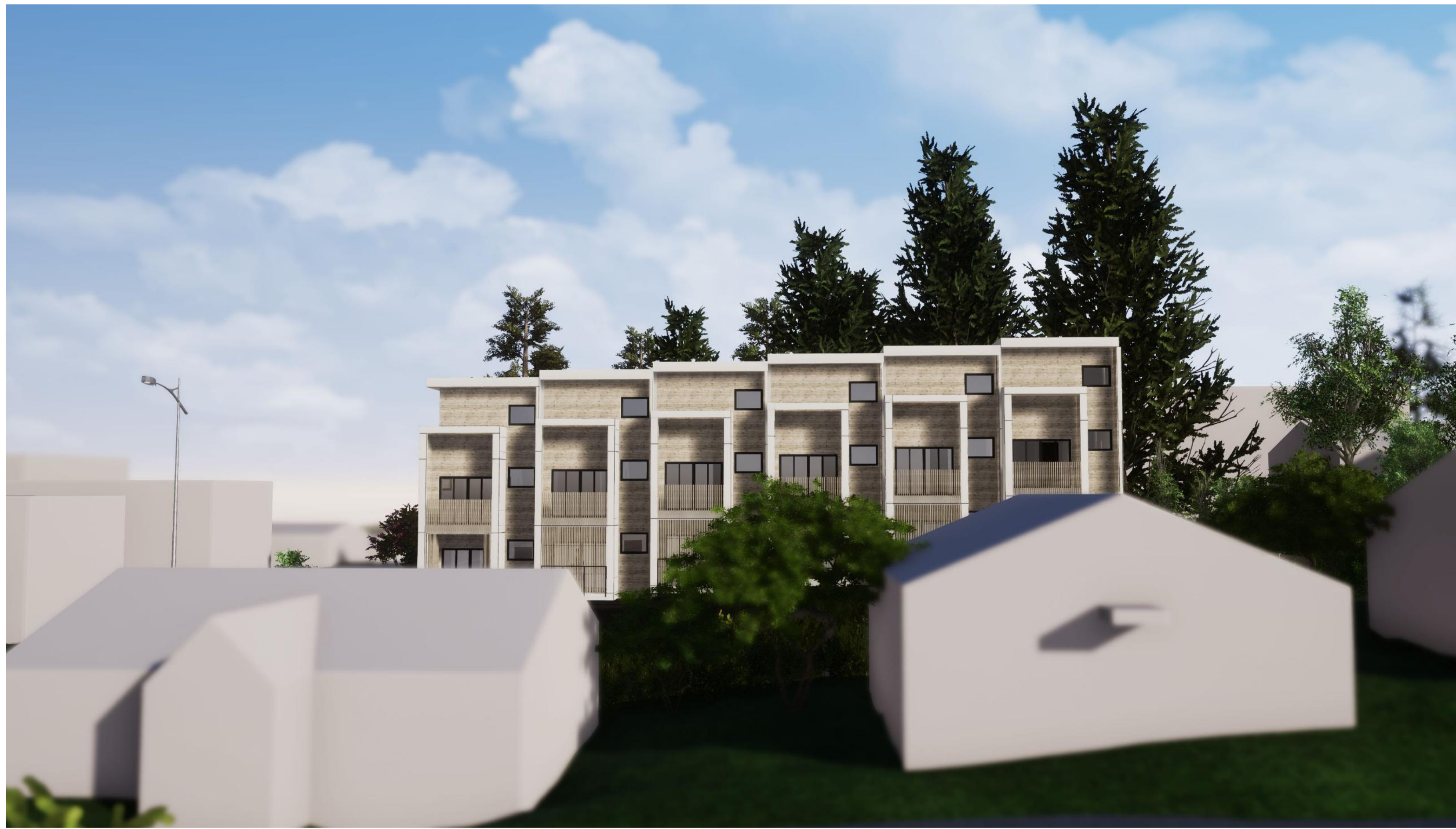
Perspective from Northern Neighbours' point of view, seen from Townsite Rd.