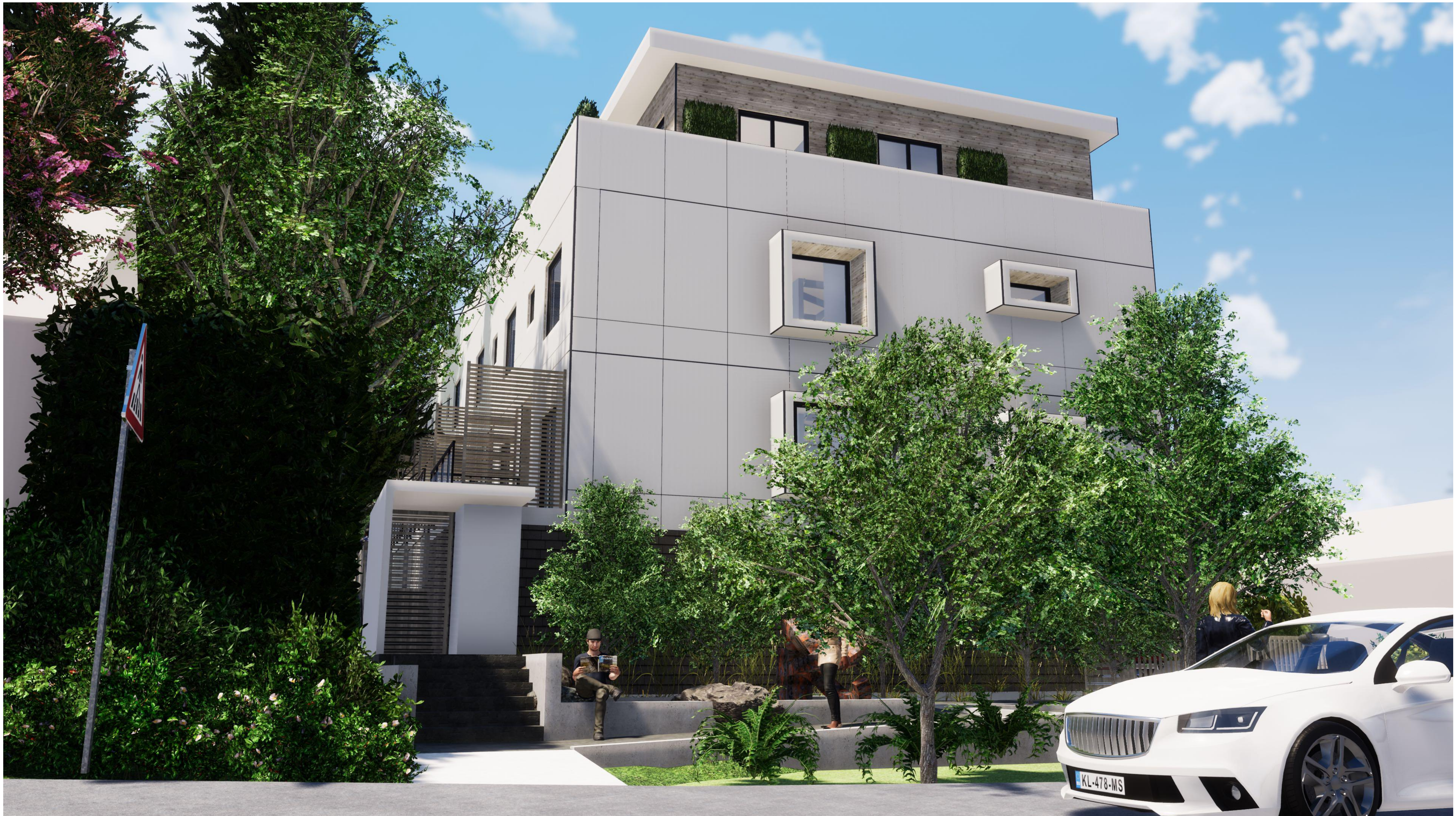
Perspective from Stewart Ave towards pedestrian entry, looking North-West