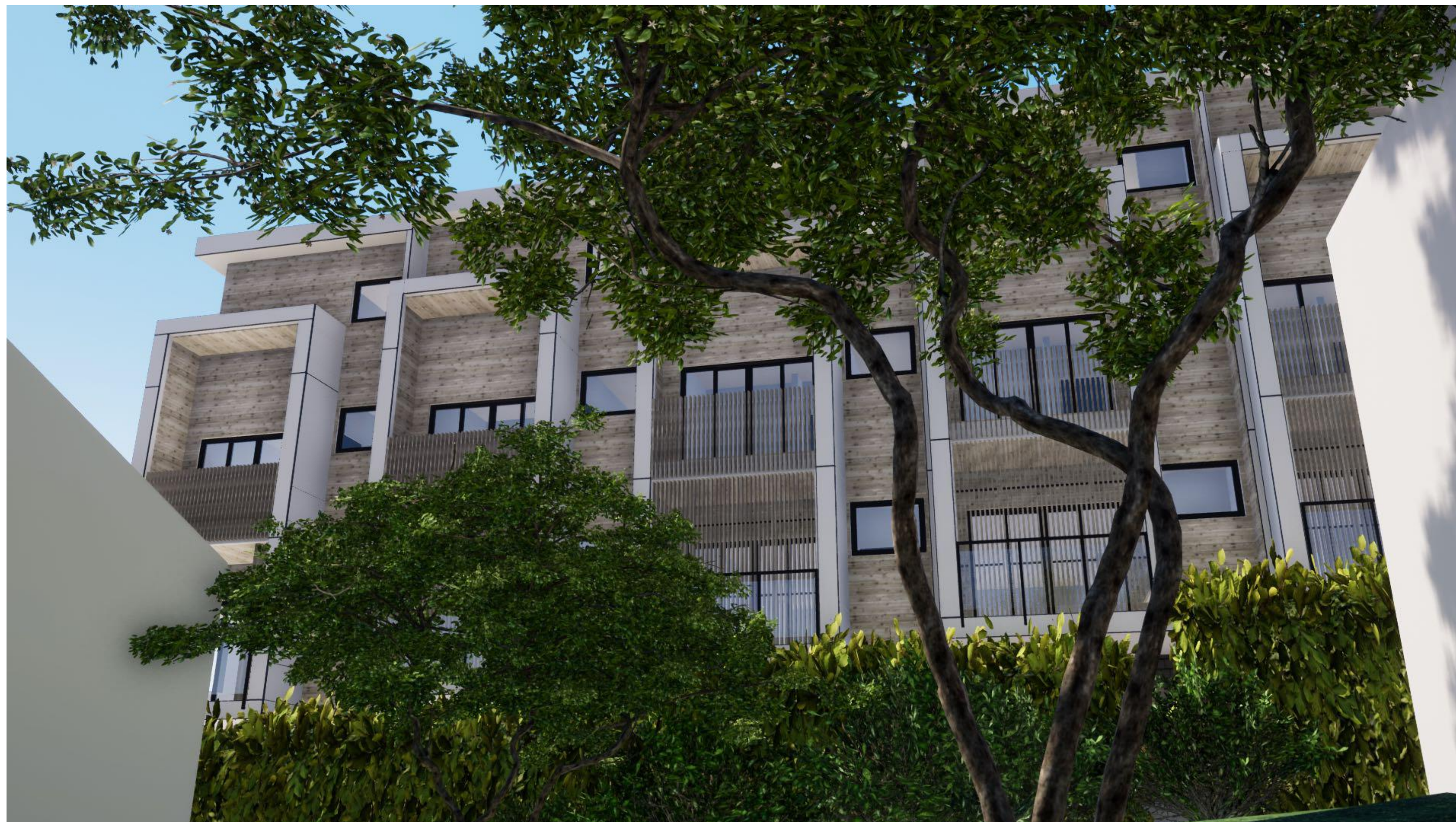
Perspective from North Neighbour's point of view, seen from neighbour back yard.