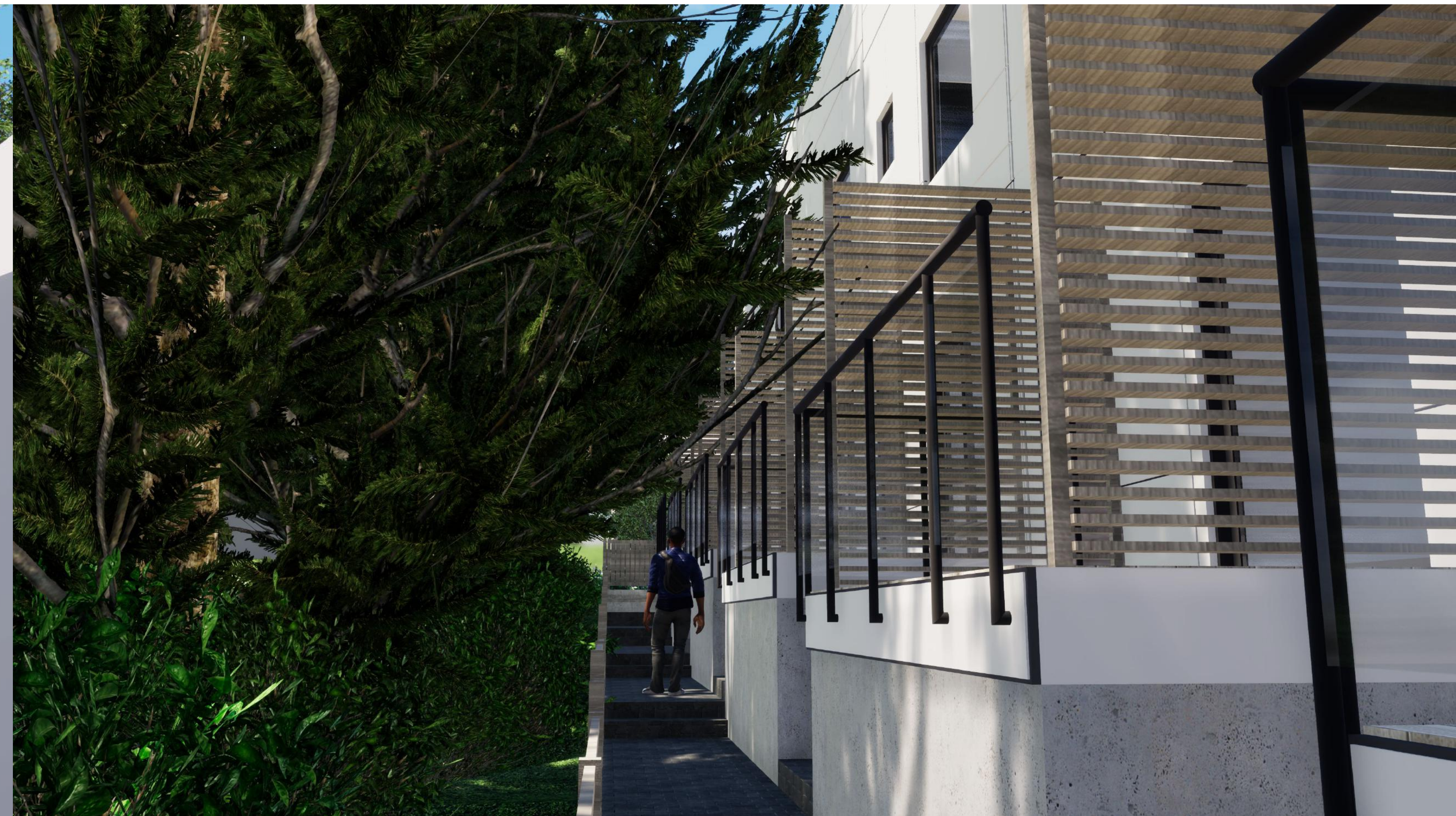
Perspective from pedestrian walkway accessing units on South side.